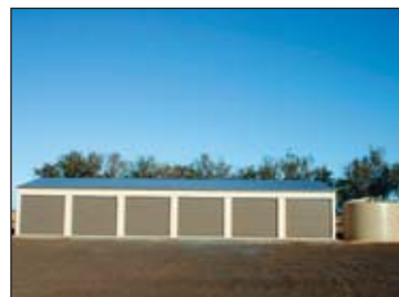
"MULTIPLE CAR GARAGE"

Quality portal framed garages available in all sizes. Standard features include Stramit guttering and downpipes, B&D roller doors and flashings to all openings and corners for an attractive finish; Available in 6 different roof pitches to suit your backyard. Plus our brand new instructional DVD for ease of erection.