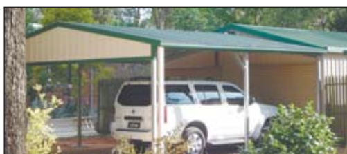
"GABLE ROOF CARPORT" With optional one end infill