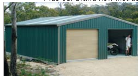
"LARGE GARAGE & WORKSHOP"

7.5 x 18 x 2.7 6 roller doors Only $11,130 Zinacalume Colorbond® $12,800