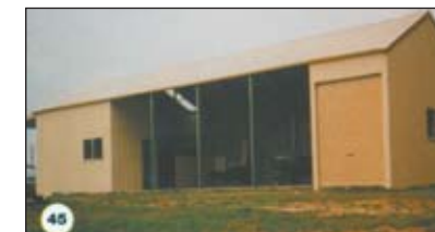
"7 BAY BIG BERTHA"

Our large range of Rural buildings include Open Front Hay Sheds and Machinery Sheds