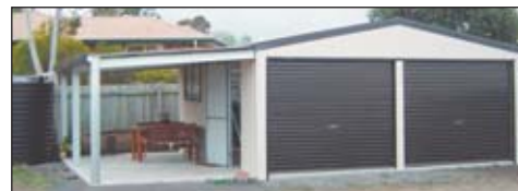
"GARAGE WITH LEAN-TO"

11.5 x 12 x 3.6 with enclosed workshop, 2 Industrial Roller Doors and Man doors, 6 Skylights 2 Whirly birds Colorbond® $16,600 Zinacalume $15,800