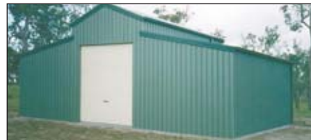
"BARN FOR THE FARM"

12m x 12m x 4.2m with 3m x 3m roller door $14,900