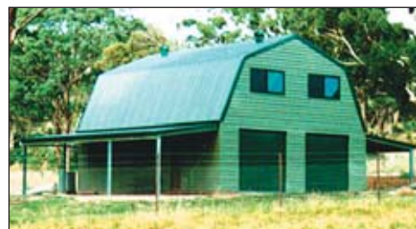
"QUAKER WITH 2 LEAN-TO'S"

7.5m x 9m x 6.3/2.7m This includes 8m mezzanine floor. 2 x 3m veranda's, 2 x roller doors, 2 windows, pa door, steel staircase. ONLY $29,400