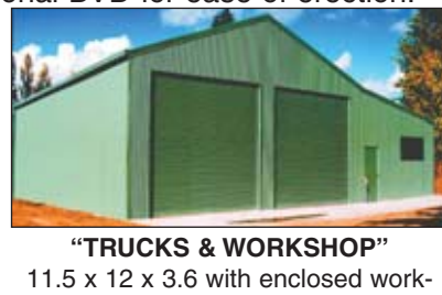
"TRUCKS & WORKSHOP"

7.5 x 10 x 2.4 with Larnec pa Door and 2 Skylights. $7980