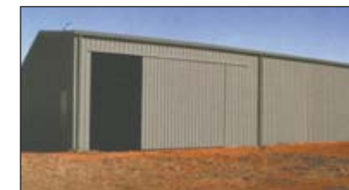
"FARM SHED WITH ELTRAK SLIDING DOOR"

As pictured in beautiful Colorbond® 7.5m x 16m x 3.6m 22 Degree Roof. 8 Skylights & 2 Whirly Birds ONLY $15,150