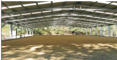
Inside width x length x height 20x36x5 $47,400 ZA / 20x60x5 $82,000 CB