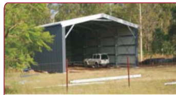
12w x 181L x 5.0m Reg A: $18,800 ZA / Reg B: $19,700 ZA Reg C: $26,150 ZA