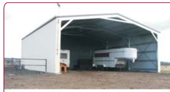
9w x 121L x 4h IL2 Reg A: $10,800 CB / Reg B: $11,550 CB Reg C: $14,400 CB