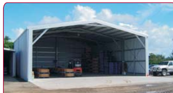
14w x 151L x 5.0m Reg A: $20,000 ZA / Reg B: $21,500 ZA Reg C: $27,350 ZA

This is a very economical way to get a large shed area, good wind and rain protection and an extra large opening.