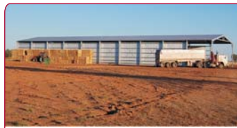
20w x 501L x 6.0 Reg A: $72,000 ZA / Reg B: $83,000 ZA Reg C: $133,000 ZA