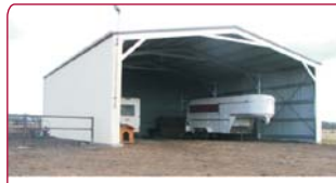
9w x 12L x 4h Reg A: $9,780 CB / Reg B: $10,300 CB Reg C: $12,590 CB