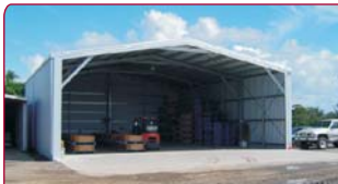
14w x 15L x 5.0m Reg A: $18,200 ZA / Reg B: $19,200 ZA Reg C: $24,500 ZA

This is a very economical way to get a large shed area, good wind and rain protection and an extra large opening.