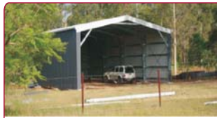
12w x 18L x 5.0m Reg A: $16,900 ZA / Reg B: $17,900 ZA Reg C: $23,600 ZA