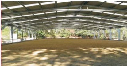
Inside width x length x height 20x36x5 $45,000 ZA / 20x60x5 $75,000 CB