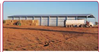
20w x 50L x 6.0 Reg A: $66,000 ZA / Reg B: $74,500 ZA Reg C: $120,000 ZA